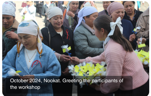
October 2024, Nookat. Greeting the participants of the workshop