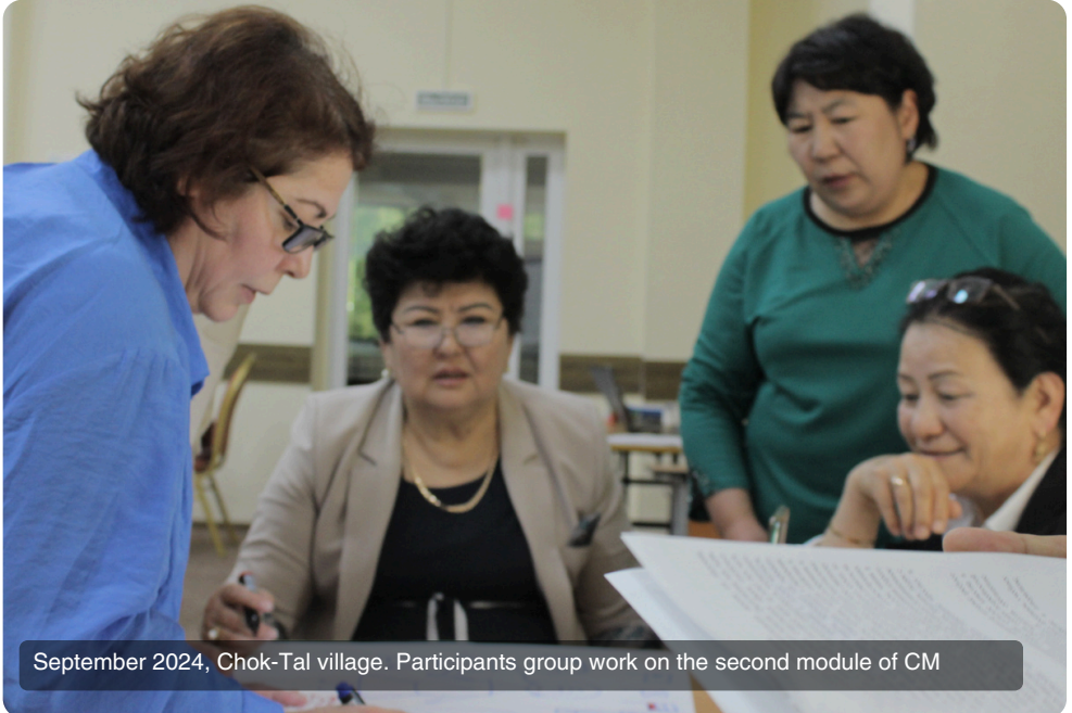
September 2024, Chok-Tal village. Participants group work on the second module of CM