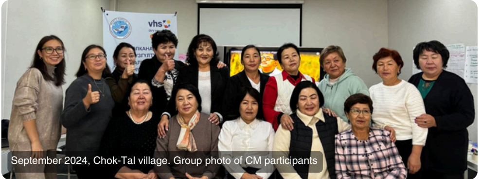
September 2024, Chok-Tal village. Group photo of CM participants

DVV International continues to support capacity building of partner organizations through Curriculum ManagerALE modul training programme for leaders. In May 2024, the course for directors of public libraries began. Participants managed to complete 3 modules, where they expanded their knowledge of adult education, learned the principles of effective cooperation, internal management, and leadership skills.