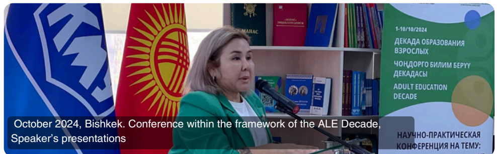
October 2024, Bishkek. Conference within the framework of the ALE Decade, Speaker's presentations