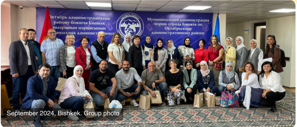
September 2024, Bishkek. Group photo