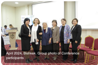
April 2024, Bishkek. Group photo of Conference participants

In Kyrgyzstan, as in many other countries, ALE is part of the continuous education system, which provides access to education throughout life. It allows people to adapt to changing conditions, acquire new knowledge and skills, and realize their potential. The conference in Bishkek became a platform for exchanging experience and information in the field of AIE.