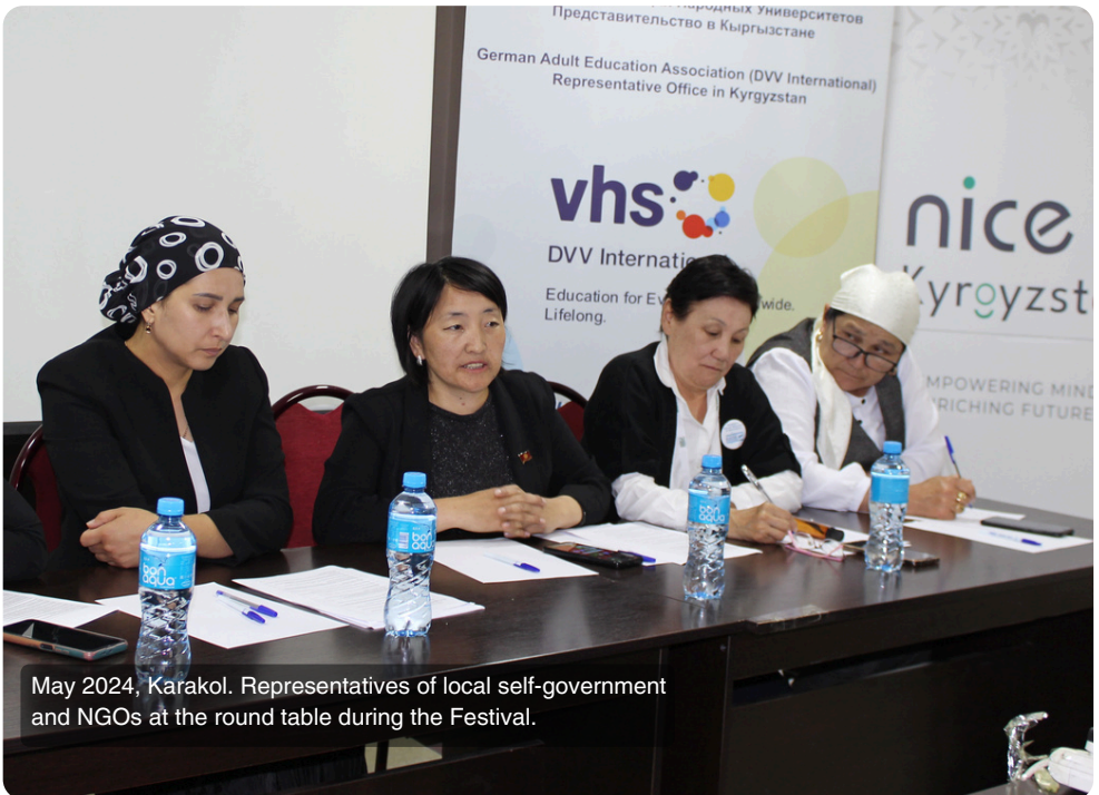
May 2024, Karakol. Representatives of local self-government and NGOs at the round table during the Festival.

The goal of the initiative : to draw attention to adult education as a powerful tool for improving the lives of each individual and society as a whole. The program included a round table, master classes, a fair, competitions, performances by local dance groups, etc. The festival was organized by the Kyrgyz Adult Education Association with the support of DVV International in Kyrgyzstan, the Karakol local authorities.