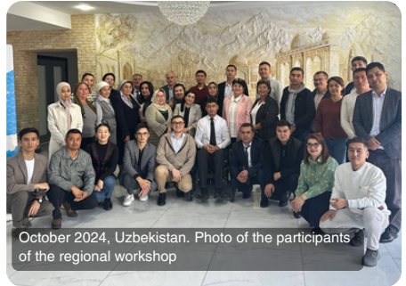
October 2024, Uzbekistan. Photo of the participants of the regional workshop

In 2024, a regional two-year project “TRUST – TogetherR Unite efforts for regional Stability” was launched. This project, covering Kyrgyzstan (Batken district and Osh city), Tajikistan ( Isfara and Kanibadam districts) and Uzbekistan (Besharik and Kuvasay districts), is aimed at supporting sustainable peace and developing good-neighborliness in the Fergana Valley.