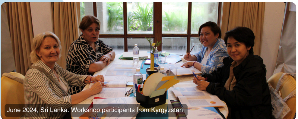
June 2024, Sri Lanka. Workshop participants from Kyrgyzstan