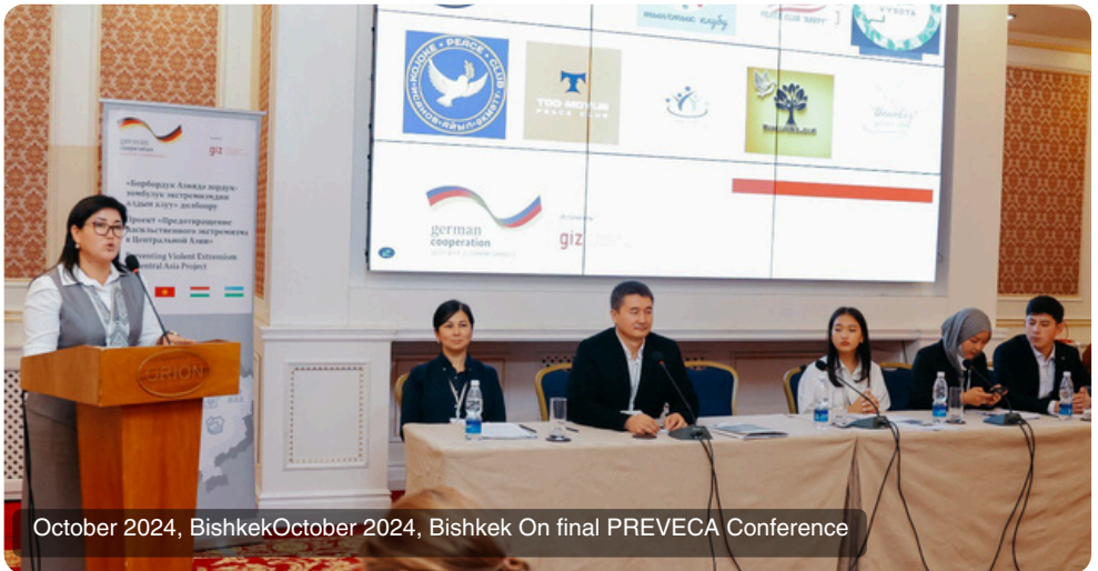
October 2024, Bishkek October 2024, Bishkek On final PREVECA Conference

At the final conference of the project “Preventing Violent Extremism in Central Asia” organized by GIZ, we presented the successful results of the project “Promoting Social Cohesion through Peace Clubs”.