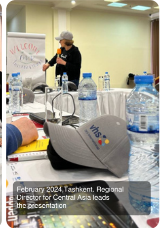
February 2024, Tashkent. Regional Director for Central Asia leads the presentation