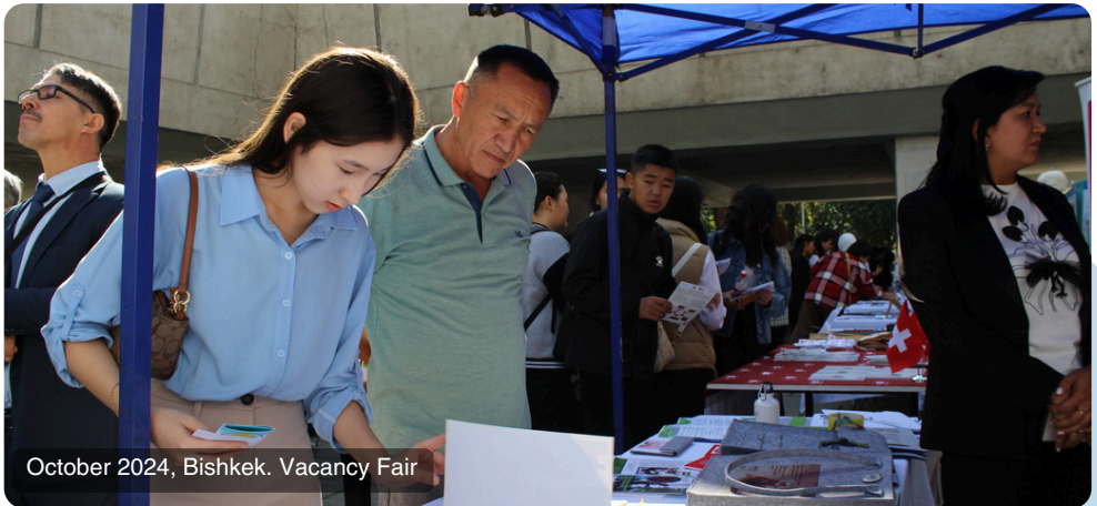
October 2024, Bishkek. Vacancy Fair