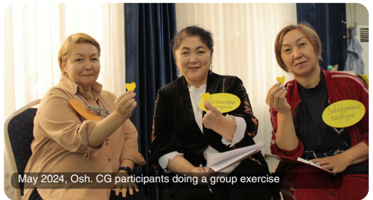
May 2024, Osh. CG participants doing a group exercise