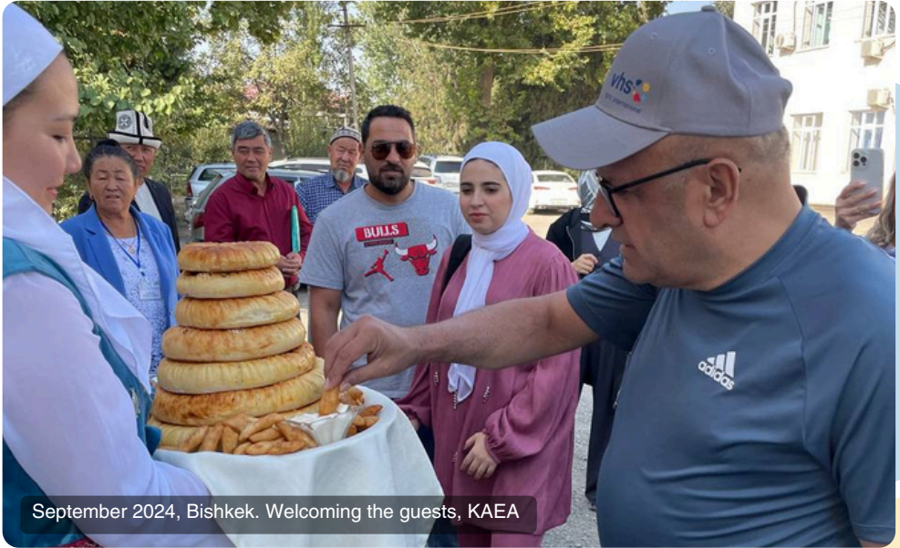
September 2024, Bishkek. Welcoming the guests, KAEA

At the end of September, the DVV International office in Kyrgyzstan and Central Asia hosted guests from Jordan. Representatives of Jordanian training centers visited Adult Education Centers in Bishkek, Issyk-Kul and Osh regions. At the meetings, local organizations and guests exchanged experiences in the field of non-formal education.