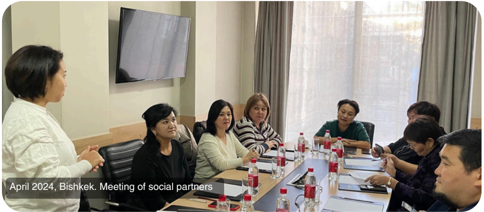
April 2024, Bishkek. Meeting of social partners

Social partnership plays a major role in promoting activities. By consolidating the efforts of partner organizations, it becomes possible to implement events more quickly and effectively. Information interaction helps avoid duplication of activities in the field of ALE.