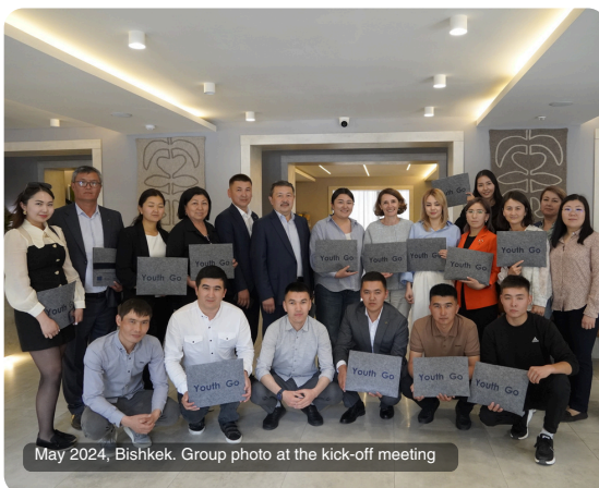
May 2024, Bishkek. Group photo at the kick-off meeting

The launch events held in the southern and northern regions of the country marked the beginning of the project. As a result of a large-scale information campaign and competitive selection, twenty-nine rural districts and small towns and twenty-nine youth initiatives from different regions of the country were identified for the joint implementation of the project.