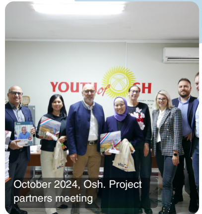
October 2024, Osh. Project partners meeting