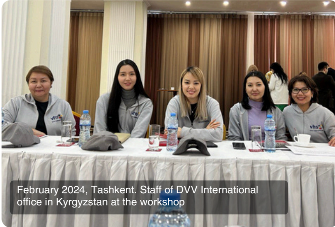
February 2024, Tashkent. Staff of DVV International office in Kyrgyzstan at the workshop

DVV International regional staff meeting in February in Tashkent is an important event in the framework of strategic management and coordination of the organization's activities in Central Asia. This is a unique opportunity for DVV International employees from Uzbekistan, Kyrgyzstan, Tajikistan and Germany to meet, exchange ideas, discuss key aspects of work in light of current and future projects and initiatives.