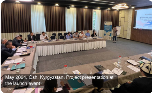
May 2024, Osh, Kyrgyzstan. Project presentation at the launch event