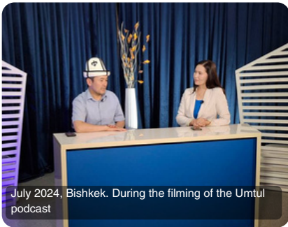
July 2024, Bishkek. During the filming of the Umtul podcast