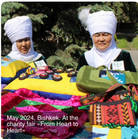
May 2024, Bishkek. At the charity fair «From Heart to Heart»

The results of the program are impressive! Many participants were able to create their own unique products and present them at various fairs. This allowed not only to replenish the budget of the Ivanovo craftswomen's family, but also to gain confidence and increase their social status. Moreover, kurak became a way of self-expression and creative self-realization for them.