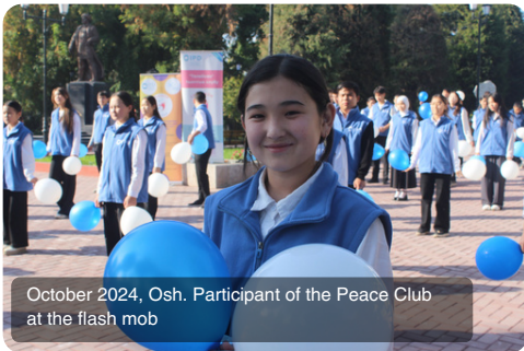
October 2024, Osh. Participant of the Peace Club at the flash mob

Over 180 young leaders attended ten local workshops on critical thinking and social media safety to prevent involvement in violent groups. Forum theatre workshops allowed participants to master the forum theatre methodology, creating productions with trainers that highlight current youth issues. Peace clubs in the project locations implemented 10 initiatives and held 26 events , reaching more than 3,000 people .