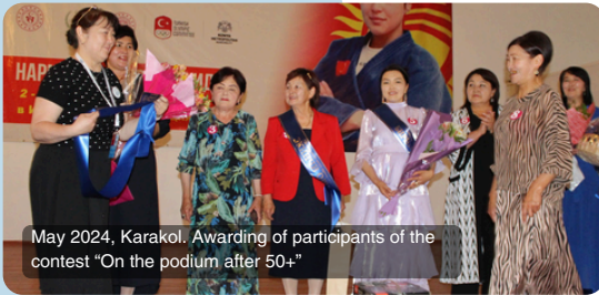
May 2024, Karakol. Awarding of participants of the contest "On the podium after 50+"

The annual Adult Education Festival in 2024 was held in Karakol city in May. The event is becoming a good tradition that brings together education enthusiasts who strive for new knowledge and development.