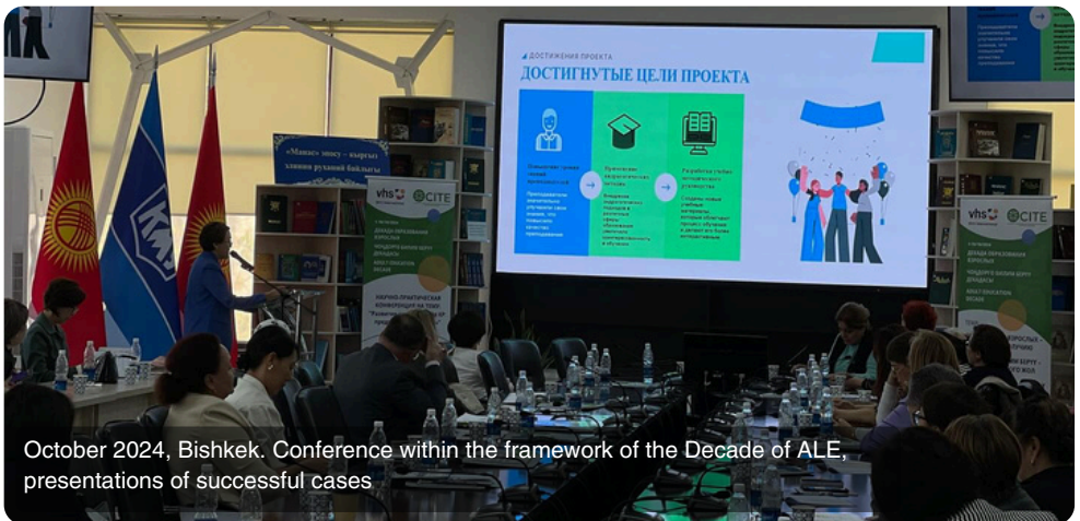
October 2024, Bishkek. Conference within the framework of the Decade of ALE, presentations of successful cases

One of the important events within the Decade was the scientific and practical conference "Development of Andragogy in Kyrgyzstan: Prerequisites and Challenges", which was attended by experts from Kyrgyzstan, Belarus and Uzbekistan, representatives of the Ministry of Education and Science of the Kyrgyz Republic, the rector of the Kyrgyz State University, leading scientists, representatives of international organizations and practitioners in the field of andragogy . The event discussed the following topics: the contribution of civil society organizations and international organizations to the development of ALE, the formation of andragogy as an independent discipline, the role of universities in the development of adult education, the development of human resources and the system of training specialists for ALE, etc. As a result, recommendations were developed for further steps in the development of andragogy and the system of training personnel in Kyrgyzstan.