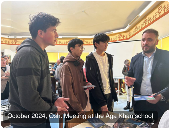
October 2024, Osh. Meeting at the Aga Khan school