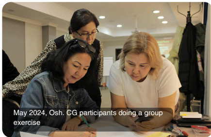
May 2024, Osh. CG participants doing a group exercise

The implementation of the program at Osh State University is an important step towards modernizing the adult education system at the university. The knowledge and skills acquired will help teachers improve the quality of education at the university, make it more in demand and relevant to current labor market demands.