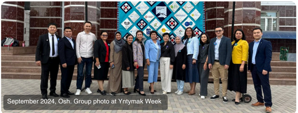
September 2024, Osh. Group photo at Yntymak Week