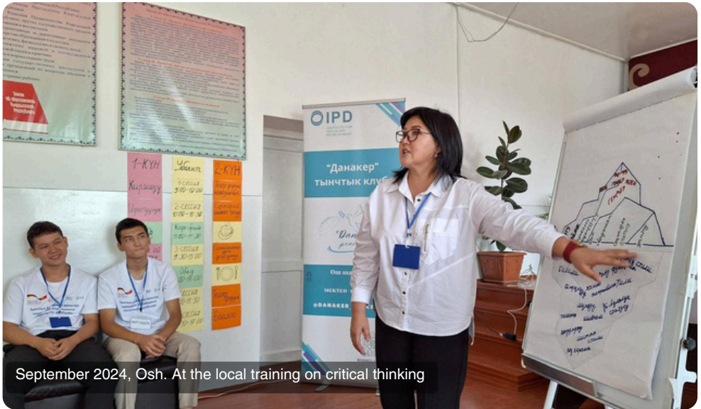
September 2024, Osh. At the local training on critical thinking

These events contributed to the creation of more inclusive and safe communities, and also provided young people with the opportunity to demonstrate leadership skills and contribute to the development of peace in the regions. The project successfully carried out An online campaign to promote a culture of peace, diversity and non-violence. More than 400 social media posts reached over 440,000 users , raising awareness of the importance of tolerance, non-violence and intercultural dialogue and strengthening social cohesion at the local level. Peace Clubs and their initiatives help young people in Kyrgyzstan build unity, security and social harmony in their communities. Education, training and active participation of youth leaders create a culture of peace that contributes to strengthening social cohesion and a sustainable future.