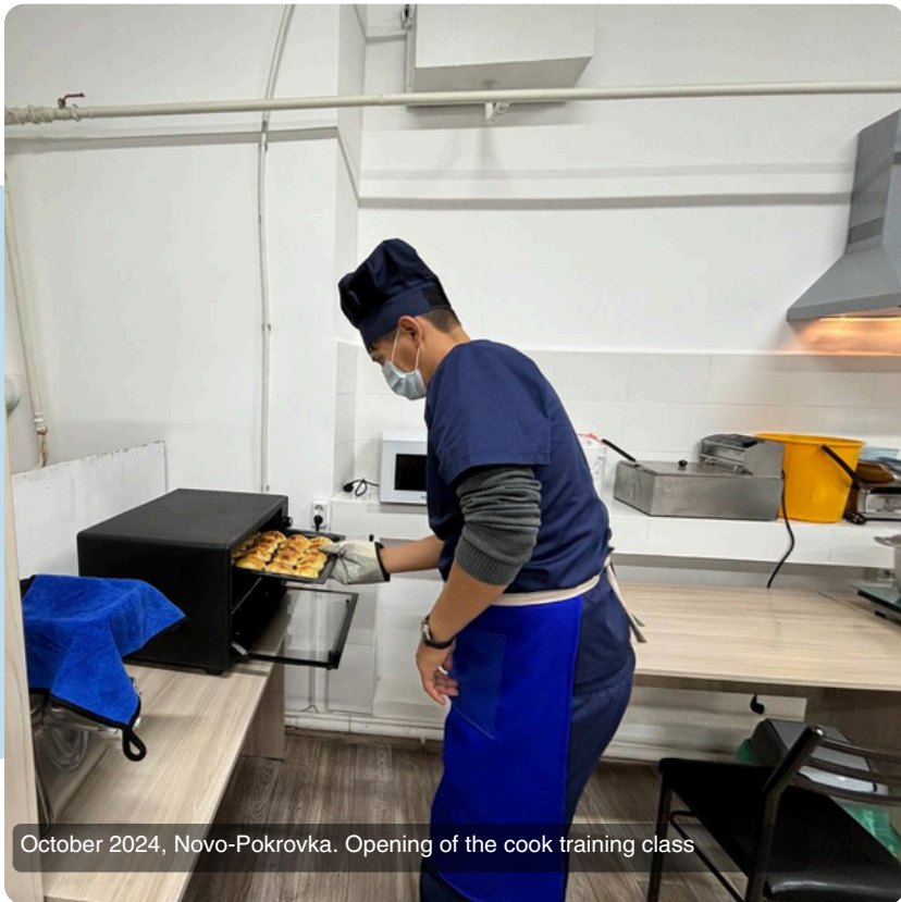
October 2024, Novo-Pokrovka. Opening of the cook training class

The project was implemented within the framework of the initiative ‘Reintegration through Adult Learning and Education’ with the support of DVV International.