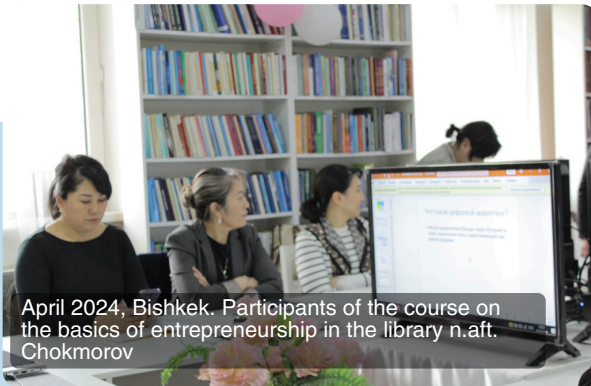
April 2024, Bishkek. Participants of the course on the basics of entrepreneurship in the library n.aft. Chokmorov

Entrepreneurship development is one of the key areas of state policy in Kyrgyzstan. Libraries, as centers of access to information and knowledge, play an important role in this process, providing the population with the opportunity to obtain the necessary knowledge and skills to open and run their own business. Within the framework of the project "Expanding access to informal adult education in public libraries of Kyrgyzstan", implemented by the Information Resource Centers (IRC) with the support of DVV International, a training for librarian trainers on the topic "Basics of entrepreneurship and business planning" was held. The knowledge gained allowed librarians to develop a 60-hour entrepreneurship curriculum tailored to local community needs and conduct on-site training. The courses have already been completed by 230 people from different regions of the country. The course program includes: Theoretical classes on the legal basis for starting a business, drawing up a business plan and the basics of marketing. Practical classes, such as excursions to successful enterprises, meetings with entrepreneurs and establishing business contacts.