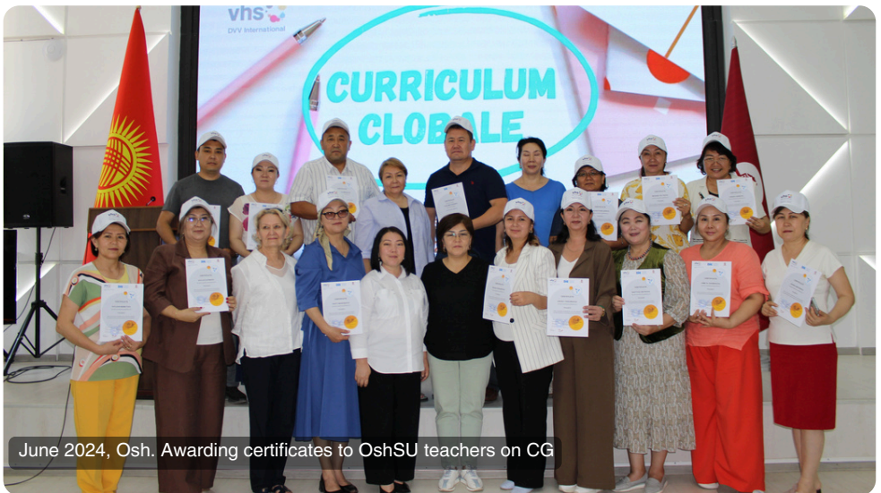
June 2024, Osh. Awarding certificates to OshSU teachers on CG