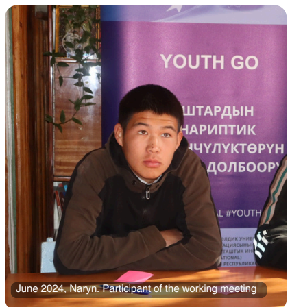
June 2024, Naryn. Participant of the working meeting