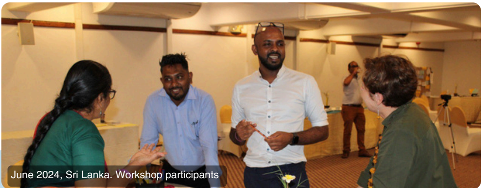
June 2024, Sri Lanka. Workshop participants

The project implementation includes 6 activities, which include the following stages: consensus building, training of master trainers in Sri Lanka together with colleagues from Laos and Jordan, selection of the Joint Evaluation Group (national and regional), training of the Joint Evaluation Groups, evaluation, data collection and systematization, as well as documentation of the evaluation results and preparation of the report.