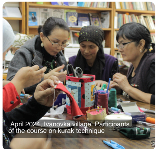
April 2024, Ivanovka village. Participants of the course on kurak technique