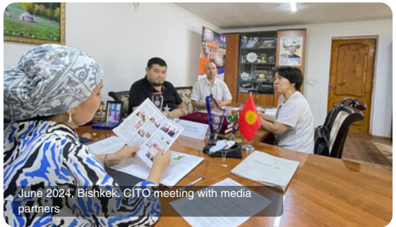
June 2024, Bishkek. CITO meeting with media partners